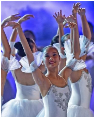
Hopes & Dreams