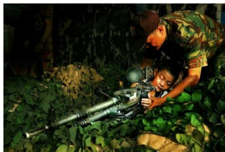
Hopes & Dreams