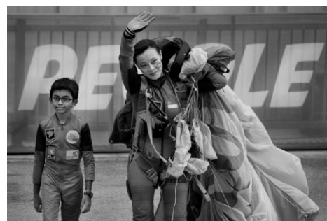
Hopes & Dreams