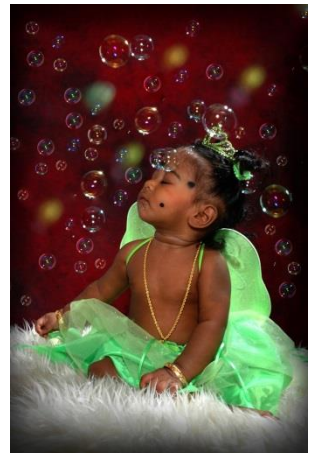
Hopes & Dreams