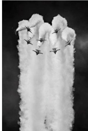
Hopes & Dreams