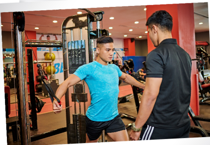
Members' rate at 7 EnergyOne Gyms