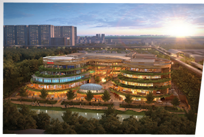
Access to 7 clubs' recreational and leisure activities island-wide