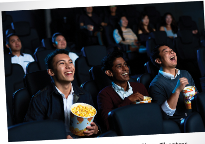
Daily discounted movie tickets at Shaw Theatres from $8 (U.P. up to $15.50)