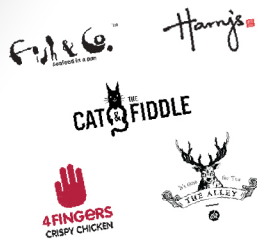
Up to 20% off at restaurants, cafes and more