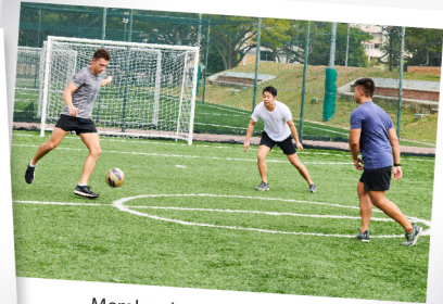
Members' rates at more than 45 sports facilities at 7 SAFRA Clubs

For more NSF's benefits, please visit: www.safra.sg/NSF