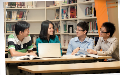
Bond-free education sponsorships by renowned institutions